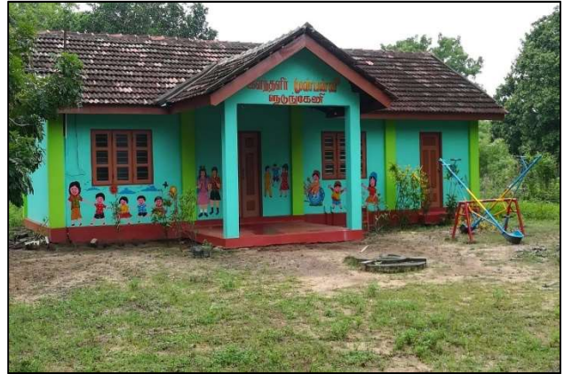
Ilanthalir PreSchool Nedunkerni renovation completed November 2020