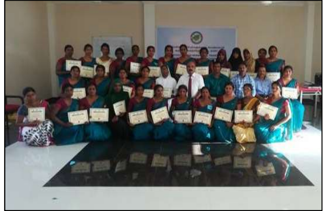
Northern Province pre-school teacher training. -July 2020