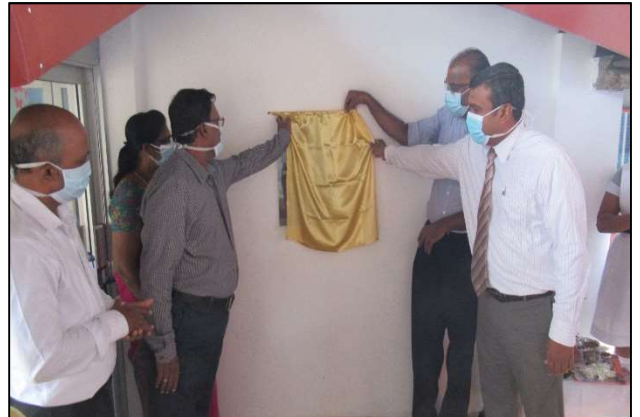
Child Center and Inpatient Child Psychiatric Unit Funded by IMHO, Opened June 9, 2020 Will provide inpatient and outpatient psychological support to the needy children of Batticaloa and the Eastern Province.