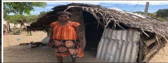
Current Living Condition: Interior of a Parankiyamadu Village Hut used for Housing, Children Eating Outside