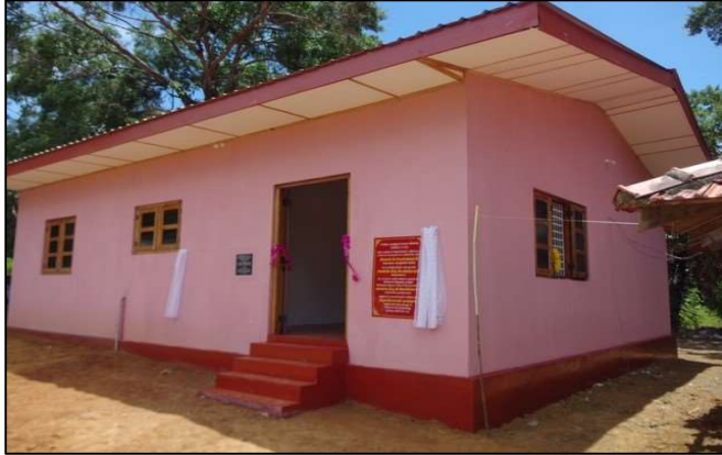
Newly Built Female Teacher's Quarters for Koddai Kaddiya Kulam TMV was opened on July 2020

IMHO News Letter November 2020: Issue 59