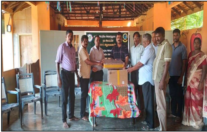
Equipment donated for Iniya Vazhvu Illam - residence for visually and hearing impaired children were donated on October 2020

Total Program Service Expenses...$435,367 Sri Lanka Total.....$431,367 USA COVID Relief.....$4,000 Sri Lanka COVID Relief.....$61,111