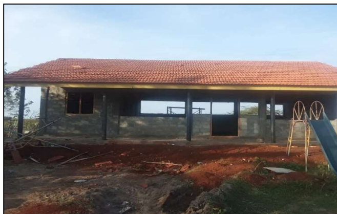
Savarikulam PreSchool rebuilding is progressing as planned