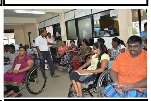
The Spinal Cord Disabled People Special Mobile Clinic