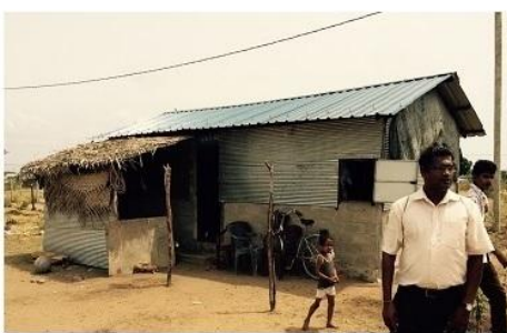
Sampoor Recently Built Housing- Additional Houses to be funded by IMHO