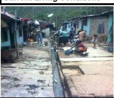
Up Country Needs in Sri Lanka