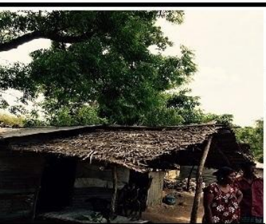
Sampoor Resettled Families Current Living Conditions