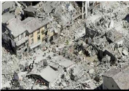
Amatrice, Italy Earth Quake