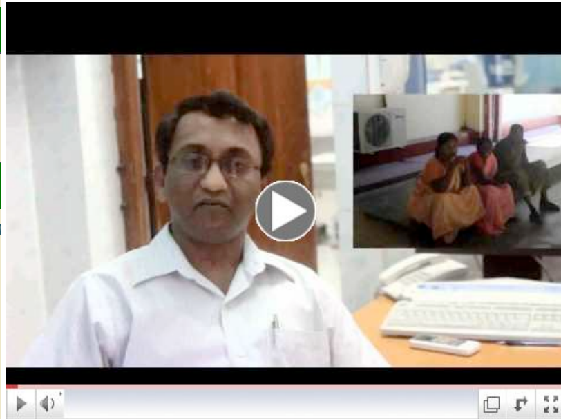
IMHO Cardiology Unit video documentary

PLEASE VOTE for our ALCS Training Video Pitch & Help us Win a Grant!