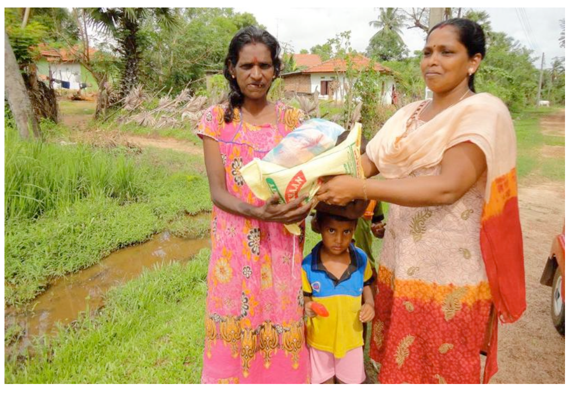
KAMHA staff hand over nutritional packs to flood victims

Although the rains may have eased and the flood waters have begun to recede, the devastation inflicted by this deadly natural disaster will have far-reaching consequences on the lives of thousands, so many of whom have been impacted by war, tsunami, and other hardship in the years prior. As always, IMHO needs your support in helping these people during their time of need. <u>Please consider making a donation today</u>. Thank you!