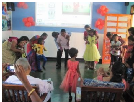
Batticaloa Autism Center (Theeraniyam) celebrates Children's Day

health, education, and hospital development among other concerns as detailed below: