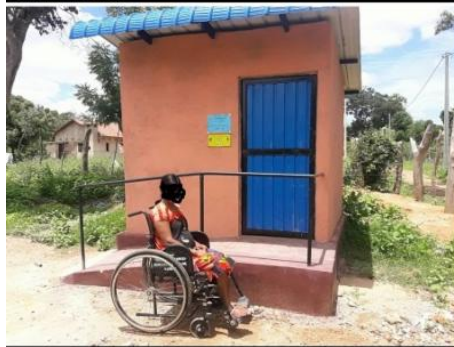
Disabled Toilets for Paraplegic patients sponsored by IMHO