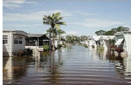
ABC News: Hurricane Irma causes damage in an East Naples mobile home park, in Naples, Fla., Sept. 10, 2017