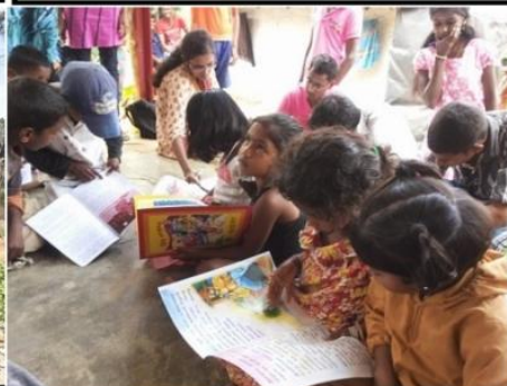
IMHO sponsors reading clubs in upcountry to promote literacy