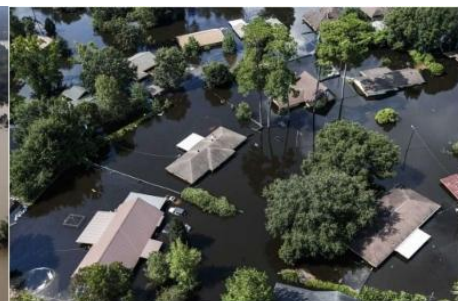
Aerial views of North Beaumont, TX. (The Beaumont Enterprise Published: September 2, 2017)