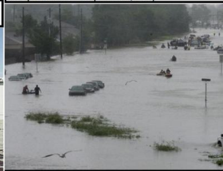
Tropical Storm Harvey batters Corpus Christi, TX (The USA TODAY Published: August 28, 2017)