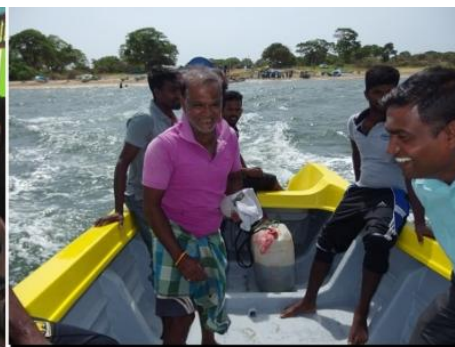
IMHO donates fishing boats and equipment in Sampoor