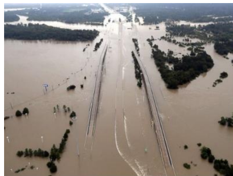
Hurricane Harvey wreaks historic devastation in Houston, TX (ABC News Published: September 1, 2017)