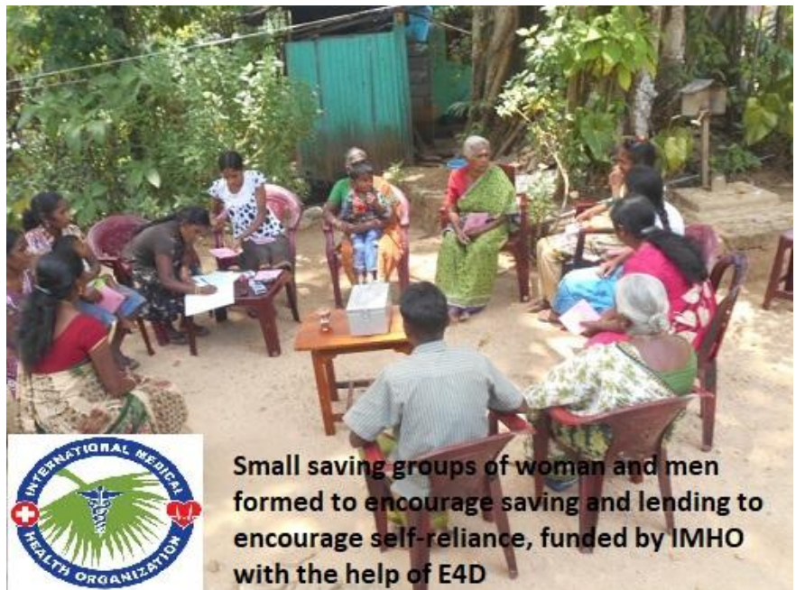
Small saving groups of woman and men formed to encourage saving and lending to encourage self-reliance, funded by IMHO with the help of E4D