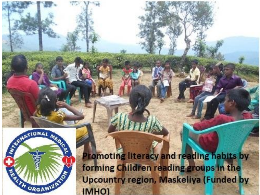
Promoting literacy and reading habits by forming Children reading groups in the Upcountry region, Maskeliya (Funded by IMHO)